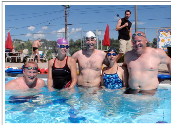
The Bowview Beauties