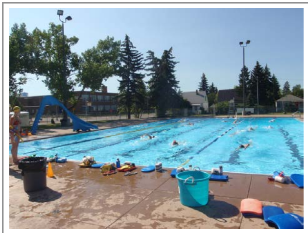
Photos from Bowview

We are looking forward to an enjoyable new season.